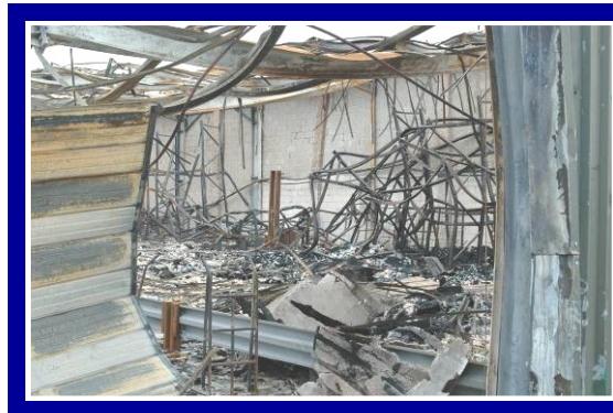
Fire Damaged Steel Framed Warehouse