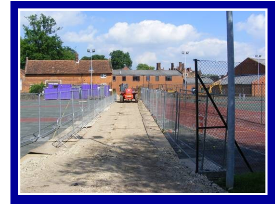
Access Way to School Extension